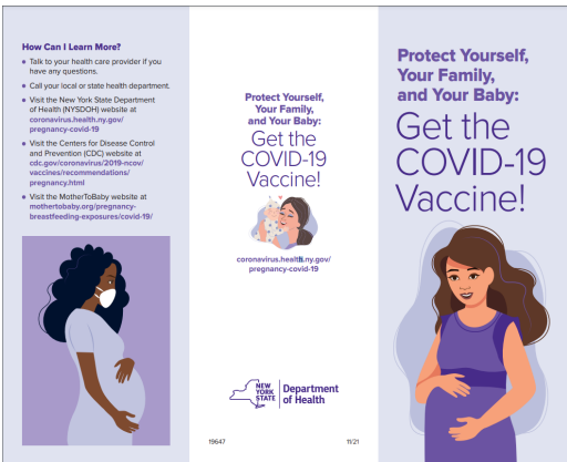
Brochure Outside Panel: English