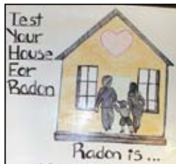
2nd Place -Raquel