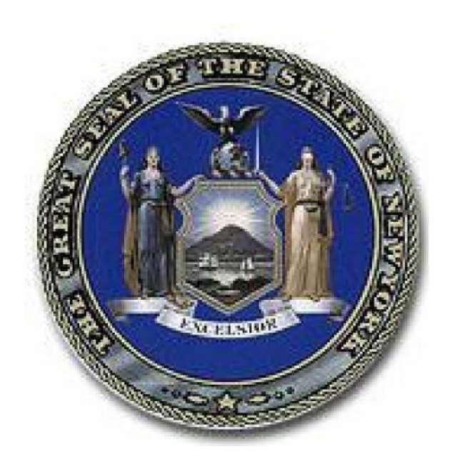
Request for Proposal (RFP) New York State Department of Health (NYSDOH) Office of Primary Care and Health Systems Management (OPCHSM) Center for Health Care Provider Services and Oversight

Medical Marijuana Seed to Sale Tracking System RFP Number 15978