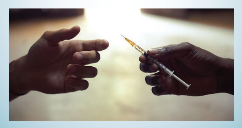
You can get HIV by sharing syringes, needles, and other things used to inject drugs.