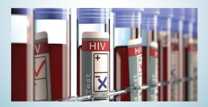
The only way to know for sure if you have HIV is to get an HIV test.