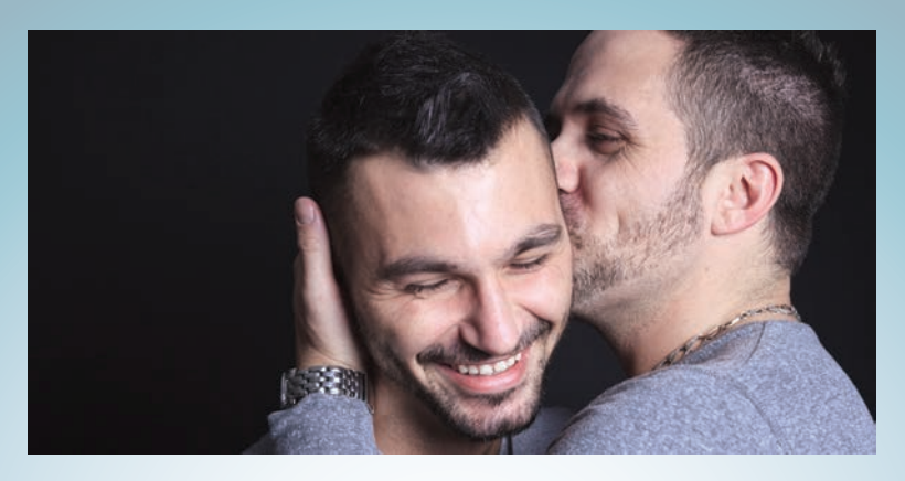
You can get HIV by having vaginal or anal sex without a condom.