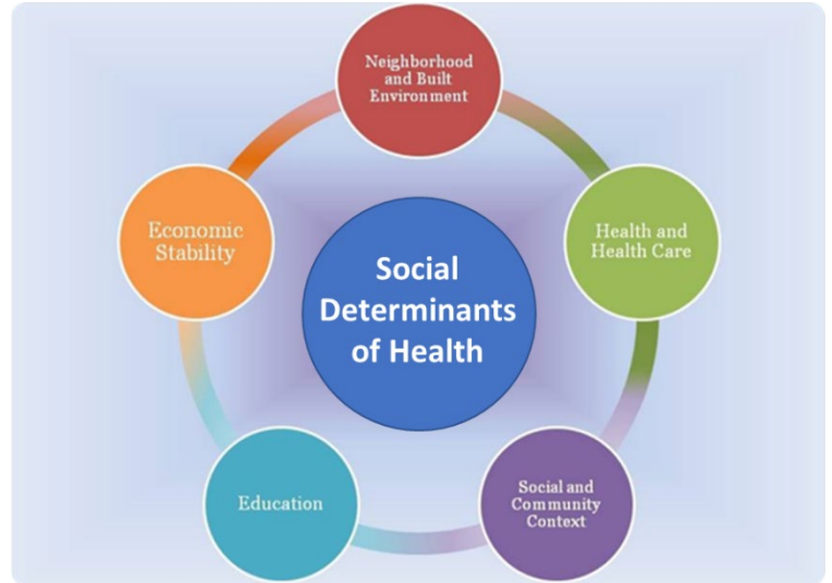
Figure 3: Social Determinants of Health