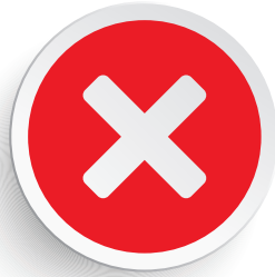
Dòmi Sou Vant