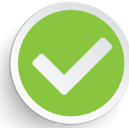
Dòmi Sou Do