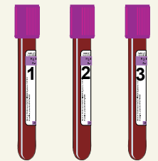
Tube #1 Tube #2 Tube #3

Label tubes in order of collection. #1, #2, #3