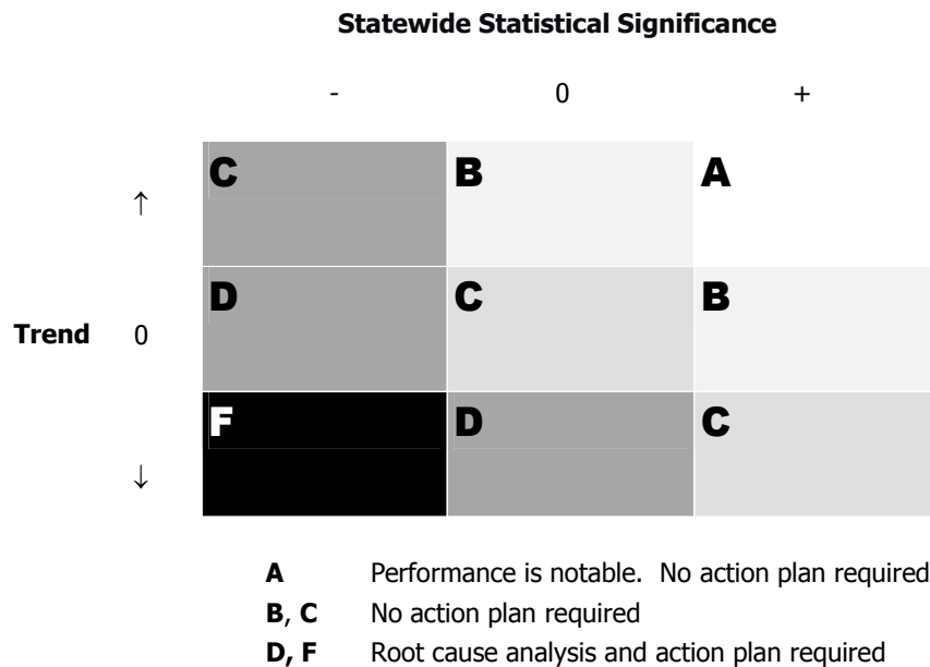
Figure 1: The Quality Performance Matrix

Reports on Medicaid quality performance, patient satisfaction, health plan comparisons, enrollment, quality improvement initiatives, and research results are made available online at: