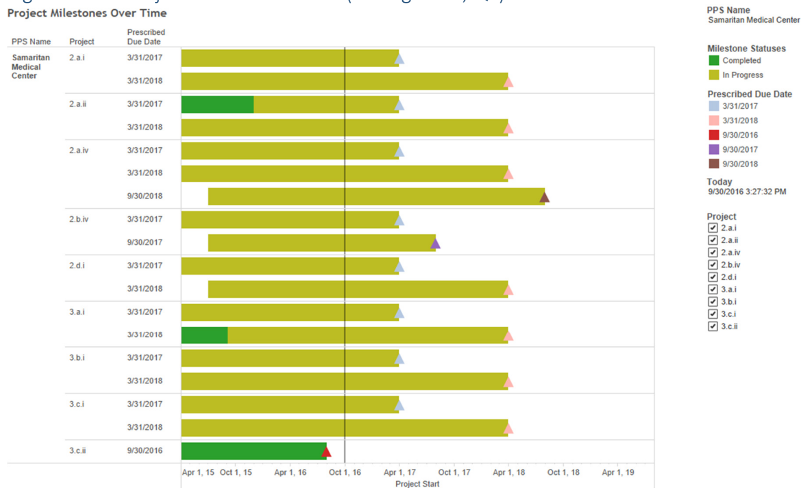
Figure 6: NCI Project Milestone Status (through DY2, Q2) 8