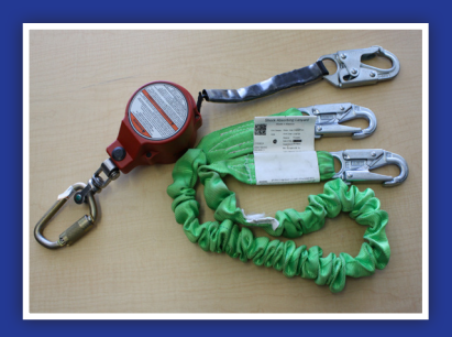
Tied to a fixed anchor