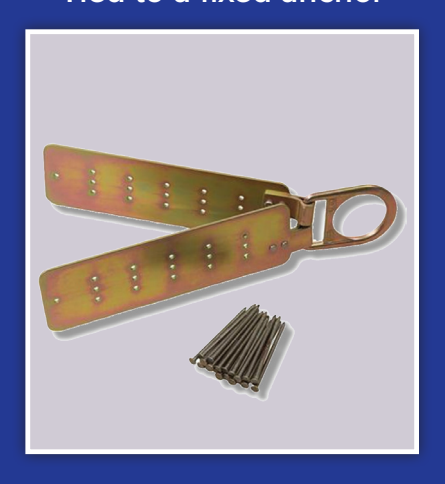
Employers should refer to OSHA and ANSI Z359 for personal fall arrest system requirements. These Images are for illustrative purposes only.