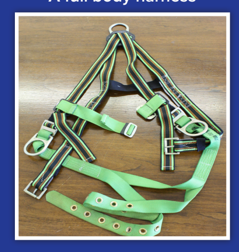
Connectors and lanyards to limit fall distance