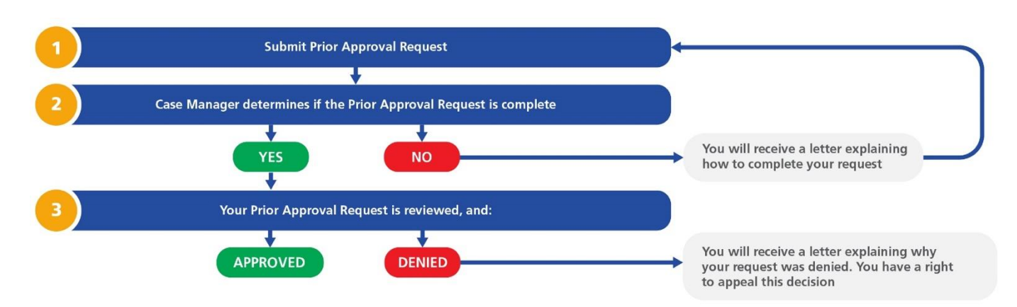
Figure 2. Prior Approval Process for Private Duty Nursing, Transportation, Experimental Treatment, Specialty Drug, and Home Supplies

Your Case Manager will determine if the documentation is complete and will contact you if something is missing. The MIF will evaluate a complete request for appropriateness, and you will be notified of the decision by mail.